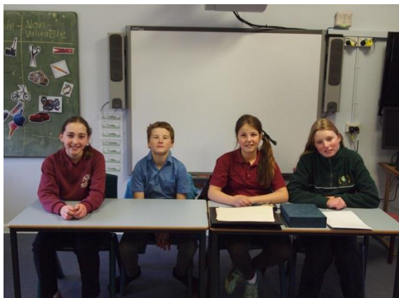
Our school leaders, ready for assembly.