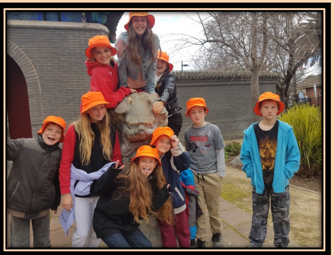
Chinese Gardens in Bendigo