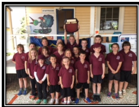
Rankin's Springs Round Robin