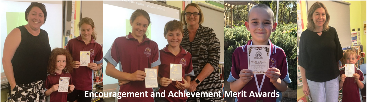
Encouragement and Achievement Merit Awards