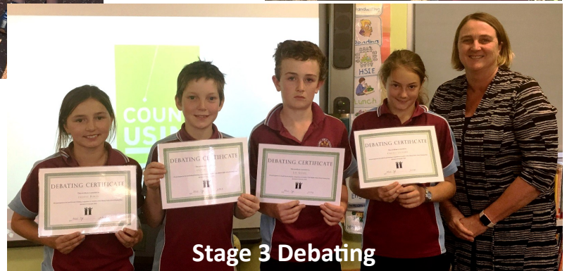
Stage 3 Debating