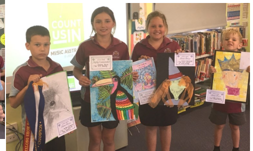
West Wyalong Show Prize Winners