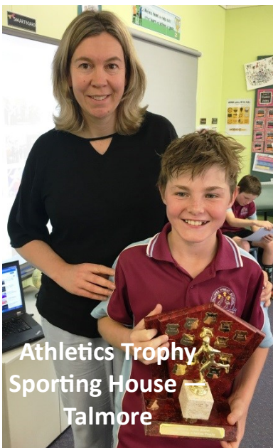
Athletics Trophy Sporting House Talmore