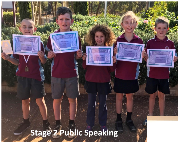
Stage 2 Public Speaking