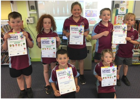
Premiers Sporting Challenge