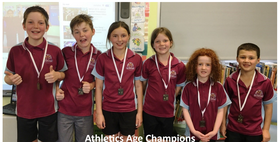
Athletics Age Champions