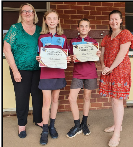
Year 6 Graduation Certificates