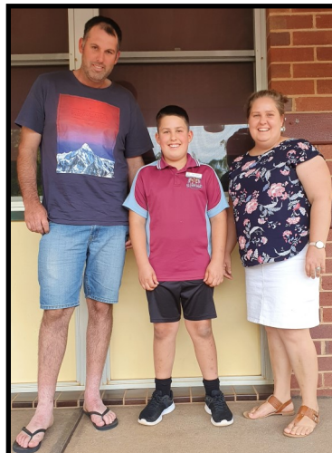
Buralyang House Captain 2021