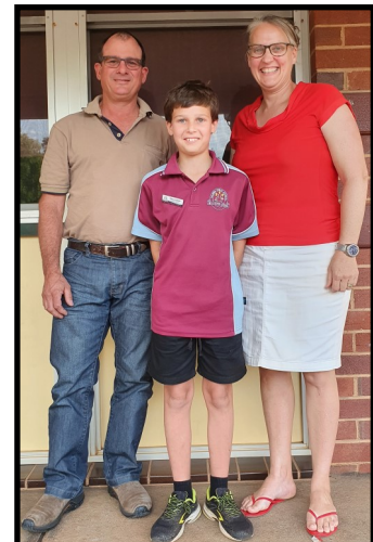
Talmore House Captain 2021