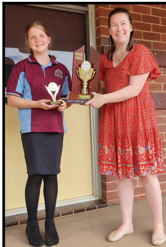
Primary Academic Achievement