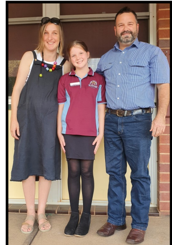
School Captain 2021