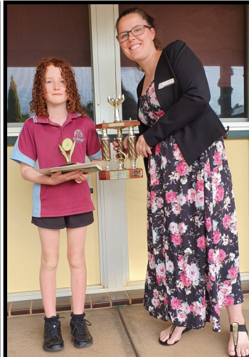
Infants Academic Achievement