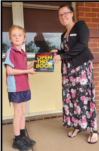
Kindergarten Book Award