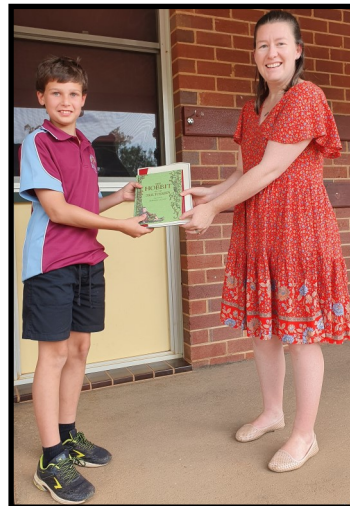
Primary Most Consistent