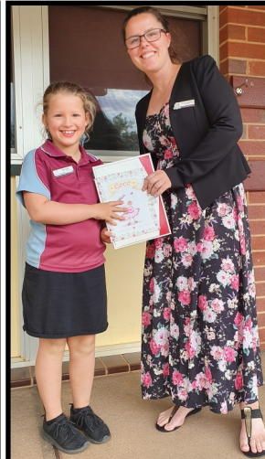
Infants Most Consistent