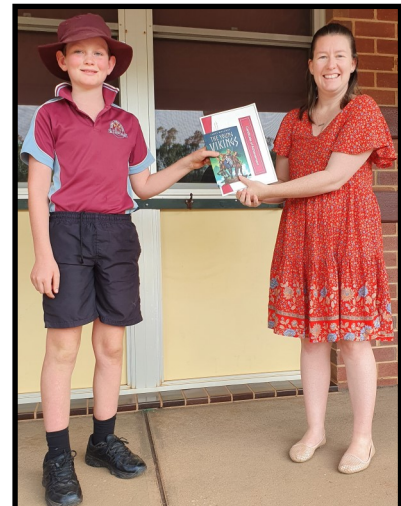
Primary Most Improved