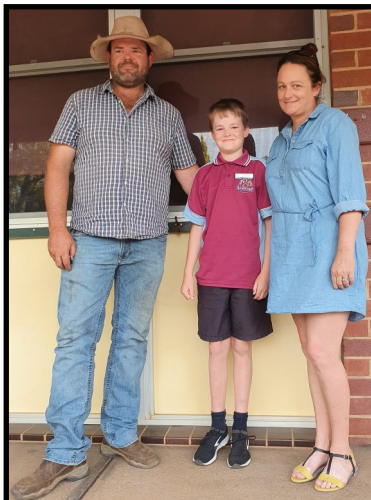
Vice Captain 2021