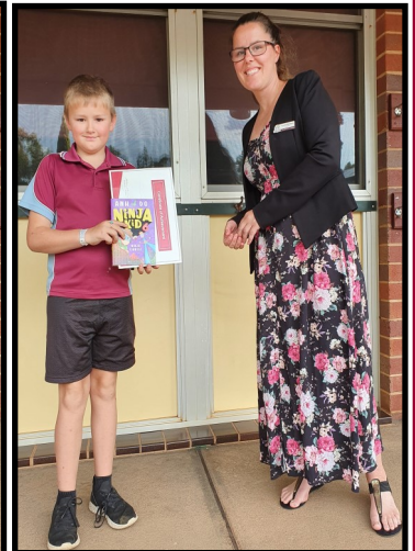
Infants Most Improved