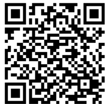
Level 3 COVID Guidelines