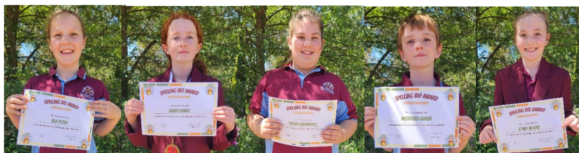
RIEN Spelling Bee Participation Certificates