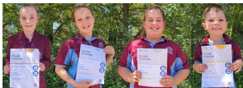
Premier Sporting Challenge Certificates