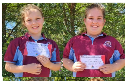
RIEN Public Speaking Certificates