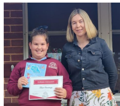
Goldenfield's Award for upholding the school values of Respect, Responsibility and Citizenship