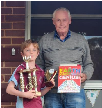
Infants Academic Achievement