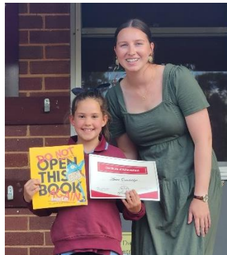
Infants Most Improved