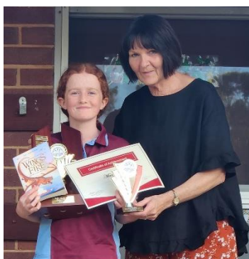
Primary Academic Achievement