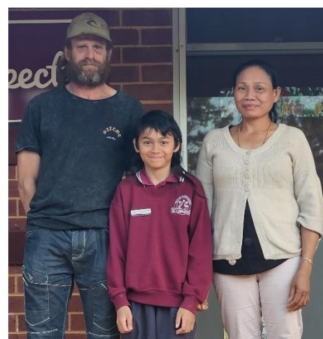
School Captain for 2023