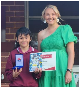
Premier's Sporting Challenge Sports Award