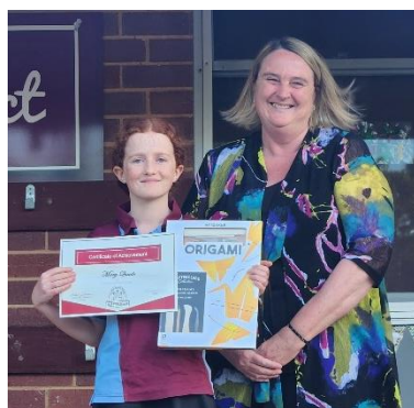
Creative and Practical Arts Award