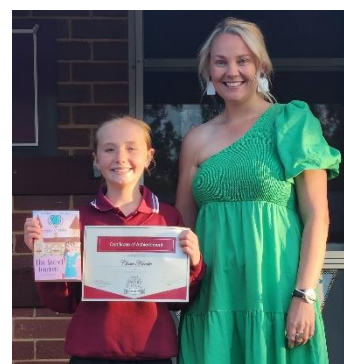
Primary Most Improved