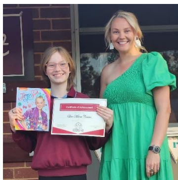
Primary Most Consistent