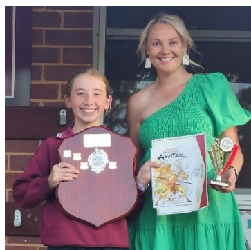
Sportsperson of the Year