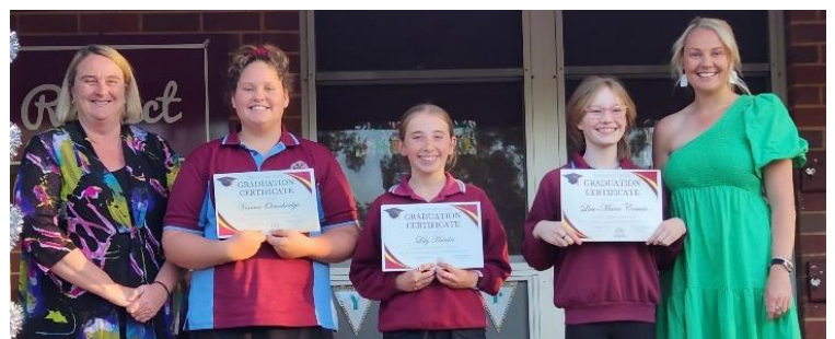
Year 6 Graduates