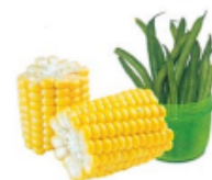
Corn on the cob and green beans