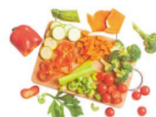
Chop extra vegetables when preparing dinner